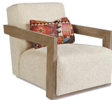
TAYLOR KING - PARRISH CHAIR BODY: I-GOWAN WHITE PILLOW: KILIM GYPSY FRAME: HAMPTONS PREMIUM