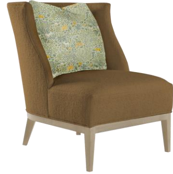
TAYLOR KING - JULIAN CHAIR BODY: WYLIE TAUPE LEATHER PILLOW: FOLK WORLD AQUATINT FRAME: HAMPTONS PREMIUM