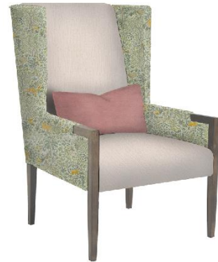
TAYLOR KING - PALMER CHAIR INSIDE BODY: I-GOWAN WHITE OUTSIDE BODY: FOLK WORLD AQUATINT PILLOW: LULU PETAL FRAME: JOANNA PREMIUM