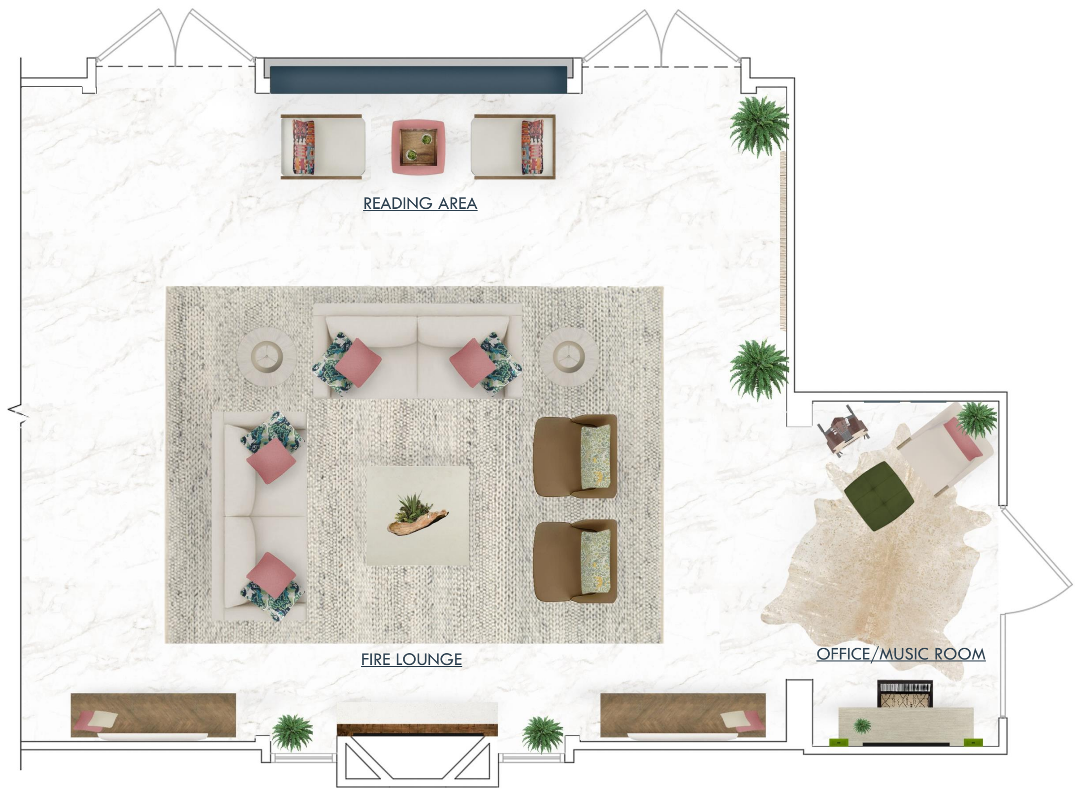
REDNDERED FLOOR PLAN SCALE: NTS