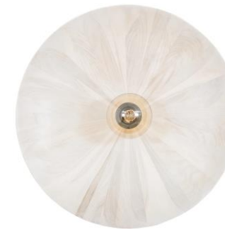
KINGS HAVEN – SHIFT SCONCE, LARGE FINISH: BURNISHED BRASS SIZE: CUSTOM