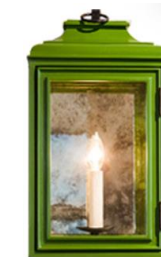
KINGS HAVEN – LUYTENS LOW PROFILE LANTERN WITH MIRROR, LARGE FINISH: PALM GREEN SIZE: 9.75"W x 4.5"D x 16.5" H