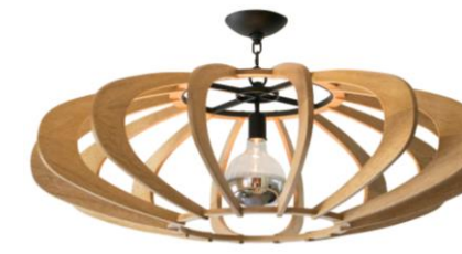
KINGS HAVEN – ASTRAL I FINISH: NATURAL SIZE: 36"W x 36"D x 11"H