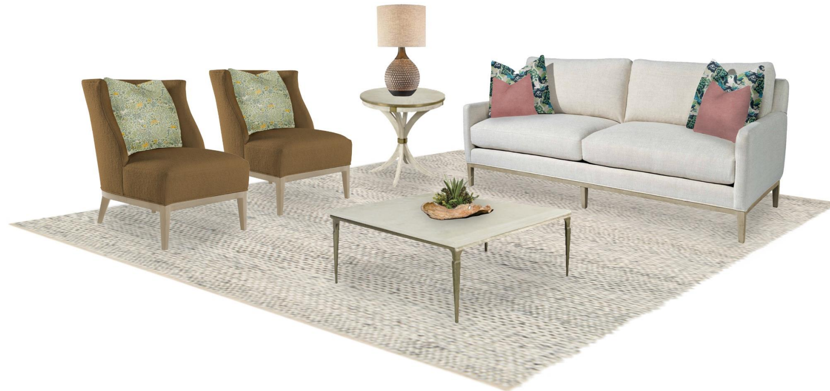
FIRE LOUNGE FURNISHINGS