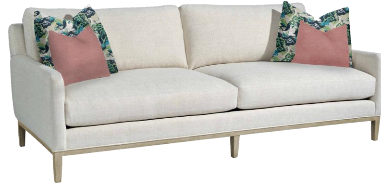
TAYLOR KING - BERKLEY SOFA BODY: I-GOWAN WHITE PILLOWS: LULU PETAL & CANTON MARRAKECH FRAME: HAMPTONS PREMIUM