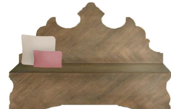
WOODBRIDGE FURNITURE – FOLK STORAGE BENCH WOOD FINISH: TAYLOR KING PILLOWS: I-GOWAN WHITE & LULU PETAL