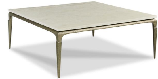
WOODBRIDGE FURNITURE – ASTORIA COCKTAIL TABLE TOP: SPANISH MARBLE FRAME: 86 TEXTURED GOLD FINISH