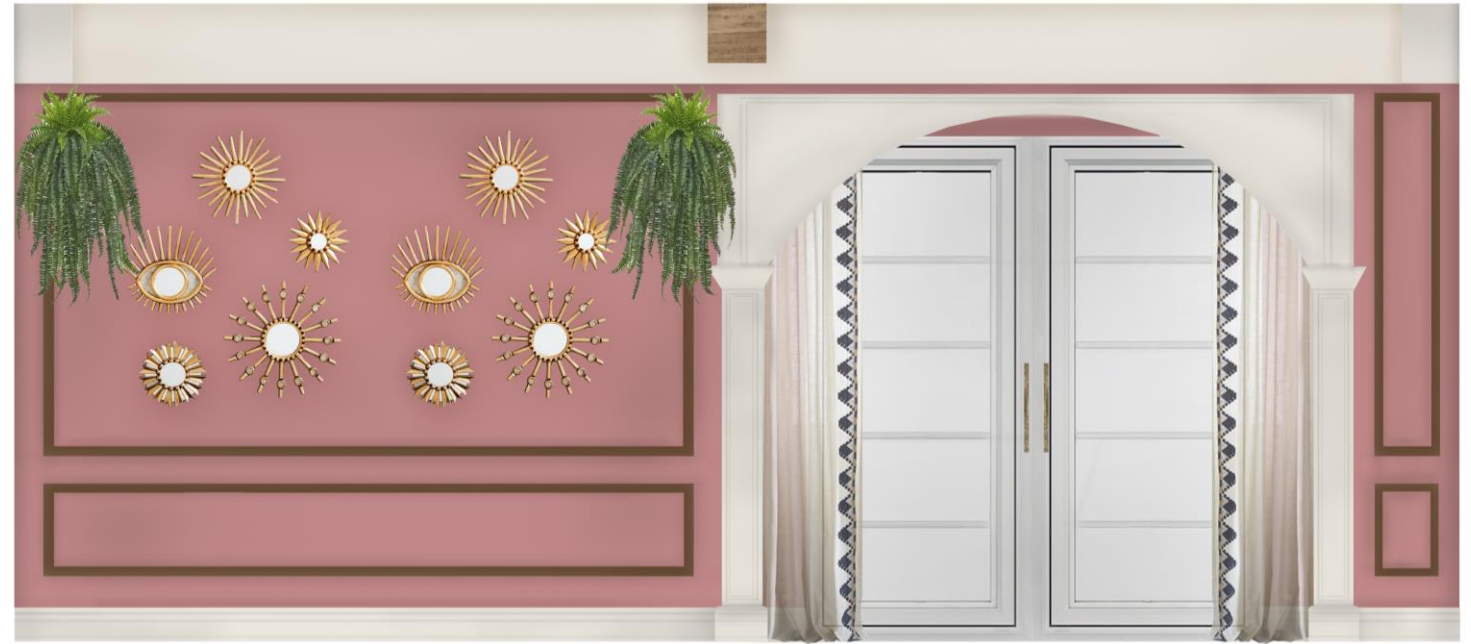
REDNDERED NORTH ELEVATION SCALE: NTS