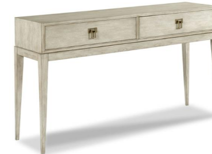
WOODBRIDGE FURNITURE – TERRENA HALL TABLE WOOD FINISH: 65 GRAYSTONE