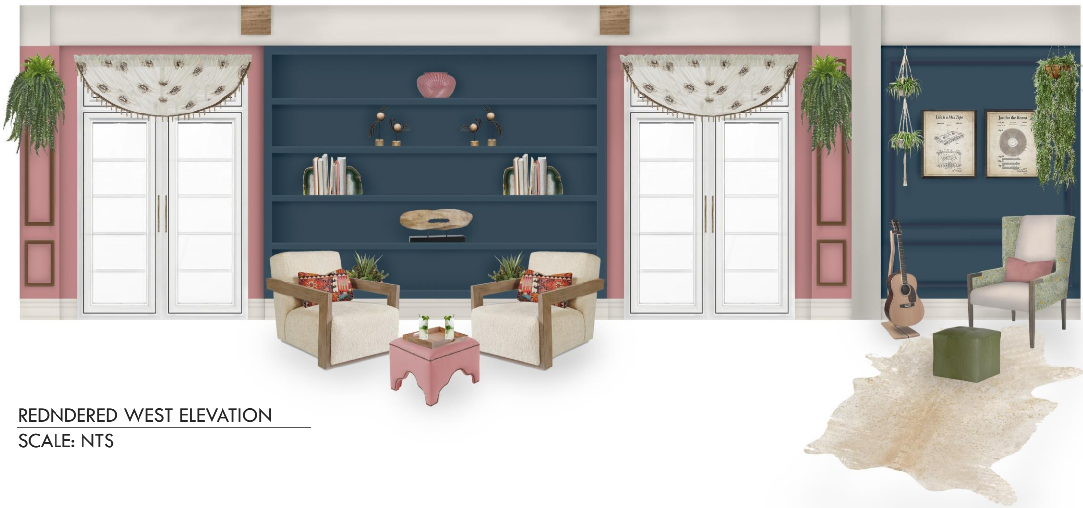
REDNDERED WEST ELEVATION SCALE: NTS