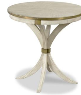
WOODBRIDGE FURNITURE – LEILANI SIDE TABLE WOOD FINISH: 62 CARRARA