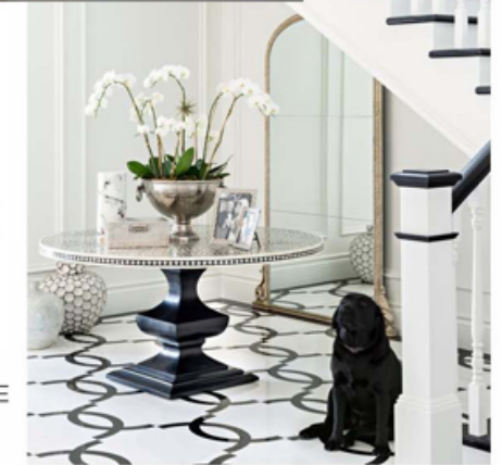
ENTRY FOYER ROUND TABLE REFERENCE