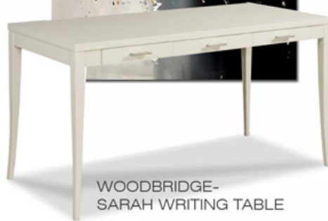
WOODBIDGE- SARAH WRITING TABLE