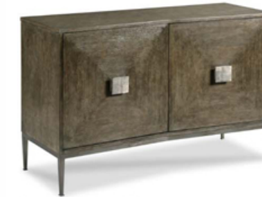
WOODBIDGE- LANGFORD CABINET