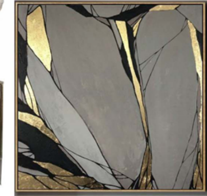
ARTWORK REFERENCE 03 IN ENTRY FOYER OPPOSITE BENCH