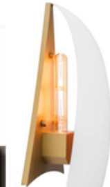
KINGS HAVEN- SAIL SCONCE ON EITHER SIDE OF ARTWORK 03