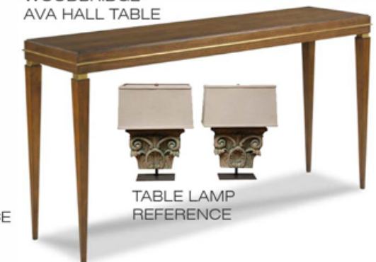
WOODBIDGE- AVA HALL TABLE