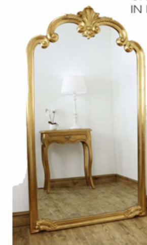
ORNATE MIRROR REFERENCE ABOVE FIREPLACE