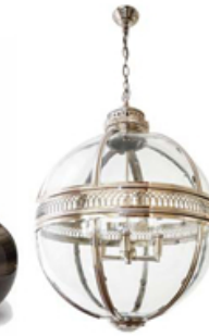
KINGS HAVEN- CHANCELLOR GLOBE IN ENTRY FOYER