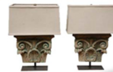
TABLE LAMP REFERENCE