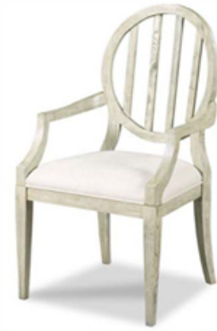
WOODBIDGE- EMMA ARM CHAIR