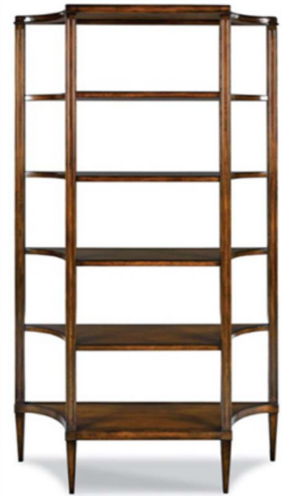
WOODBIDGE- ETAGERE BOOK SHELF