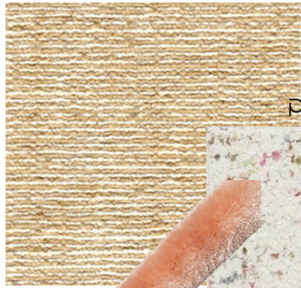
Courtier Sofa Body Fabric