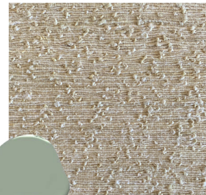
Interior Display Cabinet Wallpaper