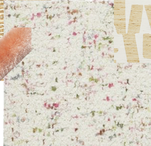
Pillow & Trim