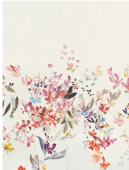
Pierre Frey Wallpaper